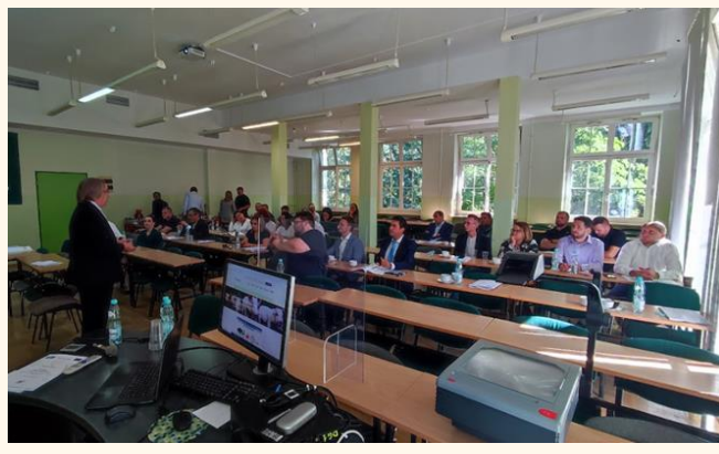
Fig. Lecture room and audience during the training

After some time (at least 6 months), the participants were asked if it was easier for them to implement the biosecurity measures after following the implementation of the SM.